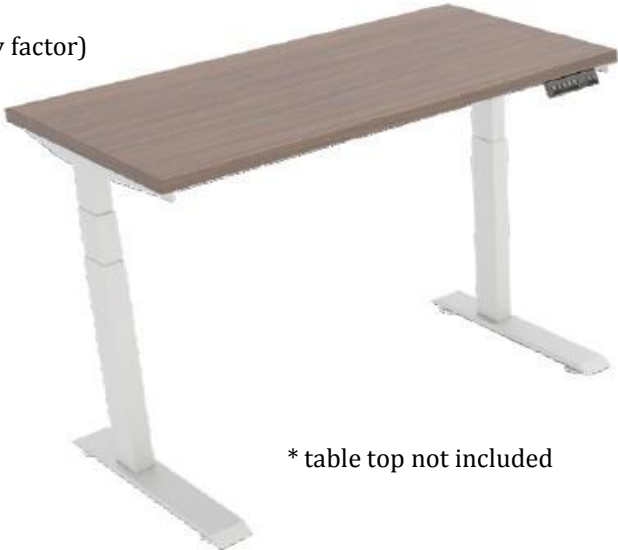
* table top not included